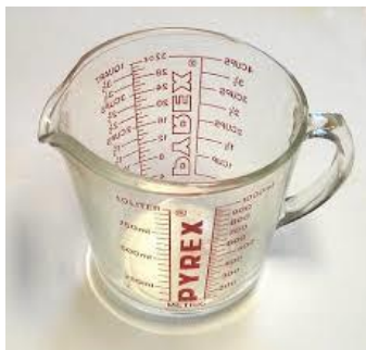
Image from Creative Commons commons.wikimedia.org/wiki/File:Measuring_cup.jpg